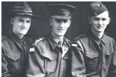
The Stichbury brothers